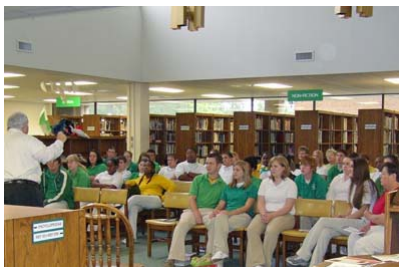
Photo taken during a performance at Richmond HS in Rockingham, NC

The play is approximately 45 minutes in length to accommodate individual school and class schedules.